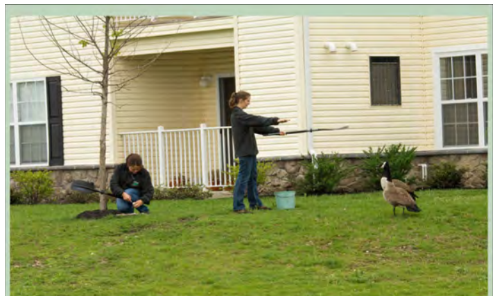
Nest Management is Best Done by a Team of Two People-- One To Treat The Eggs and One To Keep The Geese Away From The Nest

Nest defense behavior by Canada geese is encountered after the nest is located and during the process of moving the adult goose off the nest. Geese must be moved to effectively treat the eggs.