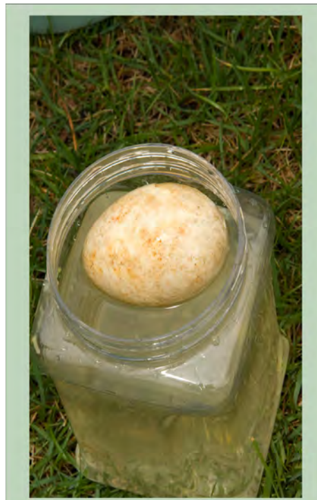
Egg is Floating and is Nearing its Hatching Date

Remove eggs from the water and proceed based on the results. If you intend to oil the eggs, it is recommended that you wipe the eggs dry with an absorbent cloth before oiling or wait until the next day (after the “egg float test”) to ensure that the egg is completely dry.